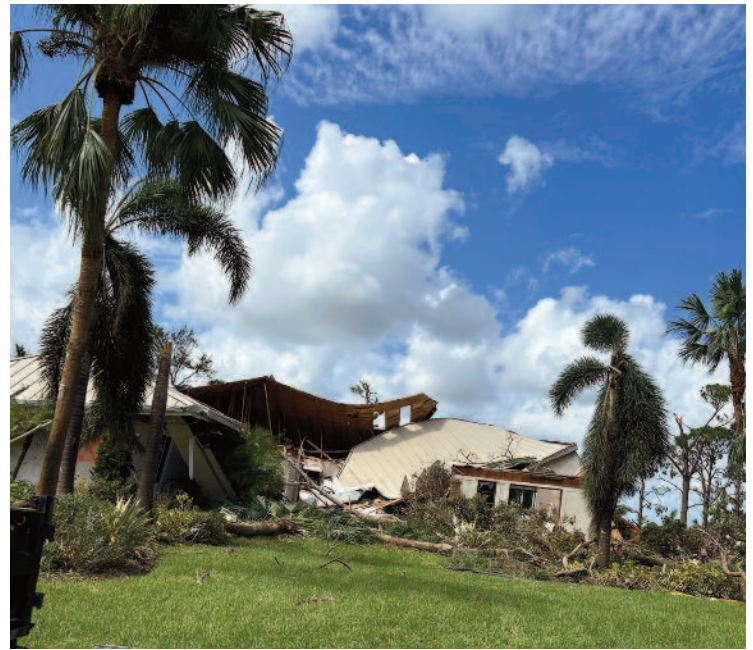
Local tornado devastation, 2024.

Can you pack up your car and head out to safety taking with you your most prized possessions, your important paperwork,