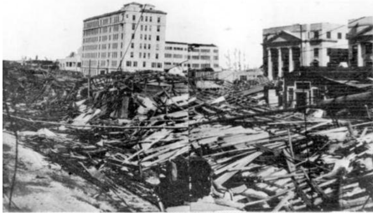
SCENE OF DESOLATION AND RUIN SOUTH OF COURT HOUSE, WEST PALM BEACH Aftermath of the Okeechobee Hurricane, 1928.

In Hobe Sound's history, we know that as early as 1696 a hurricane caused the shipwreck of Jonathan Dickinson's barkentine, The Reformation, on our shores. Going forward there have been many other notable hurricanes affecting this community. A few we can reference here include the devastating 1928 "Okeechobee" storm. A horrific category 4 storm with its lethal fury came ashore at Palm Beach with winds up to 145 mph on September 16 into the early hours of September 17th and passed over Lake Okeechobee breaking through the dikes with the force of a tidal wave and sending rushing water through swampy farmland sweeping away homes and taking the lives of nearly 2,500 people. This storm continued for approximately 6 hours with relentless wind and sheets of rain. Flood waters persisted for several weeks. Damage was in the range of $100 million.