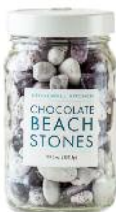
Stonewall Kitchens Beach Shells and Stones

These stocking stuffers can actually help you Save the Ocean! Made from recycled water bottles.