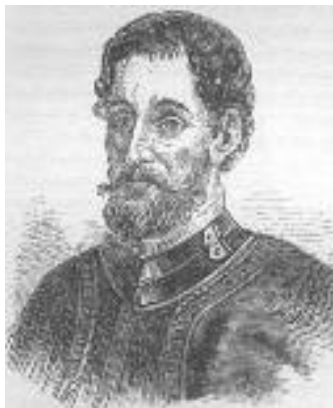
Hernando de Soto

Florida was admitted as the 27th state on March 3, 1845, and the state motto is the same motto as that of the whole United States, "In God We Trust." Another fun fact about Florida is that it is the flattest state. Yup, even flatter than Kansas. Florida has the smallest difference between its high and low points with only a 345-foot difference in elevation across the whole state. Its mean elevation is only 100 feet. And did you know that Florida has the most lightning strikes in the U.S.? Although Tampa is referred to as the "Lightning Capital of the World", Daytona Beach, Fort Myers, Key West, Miami, Orlando, and Tallahassee are among the most lightning-strike prone cities on the continental United States. Speaking of "most", it is reported that in all of North America the most varieties of seashells can be found on the beaches of Fort Meyers, Captiva Island, and Sanibel Island.