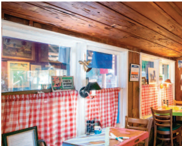
Harry and the Natives interior dining area