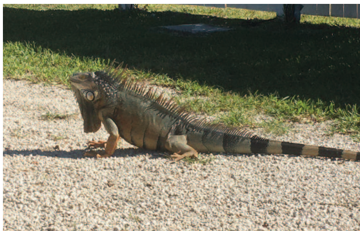
Green iguana

Much the same can be said of Florida's wildlife. Our State's climate has welcomed not only people, but all sorts of plants and animals that either hitch-hiked here from far away places among unsuspecting hosts, or simply managed to escape from captivity once they had arrived. Florida's ecosystems, however,