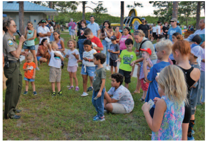
Junior Ranger swearing in ceremony

AmeriCorps members, 20-person burn crew, Palm Beach County ERM staff, FWC staff, as well as the Florida Park Staff from JD and its neighbor parks.