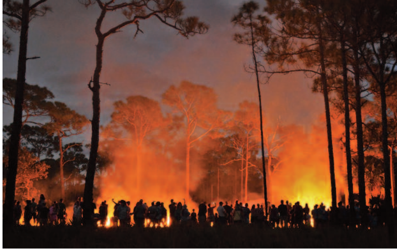
Night Burn Demo

Jonathan Dickinson State Park held its 16th annual Fire Fest community event on October 15, 2022. Fire Fest is all about the importance of prescribed fire and by using live fire demos, the community gets to a hands-on learning experience. Guests enjoyed spraying the fire hose, watching burn demos, hayrides, and swamp buggy tours through the woods. Along with exhibitors and vendors (including Smokey Bear), guests also enjoyed guided hikes, live music, and food trucks. Among the 2800 people who attended, the Park welcomed 89 new Junior Rangers who participated in a swearing in ceremony to continue to learn all about the Real Florida. The Park would like to thank the 120 volunteers, 12