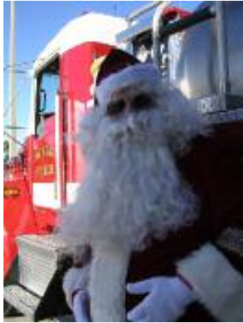
Santa arrives in Hobe Sound