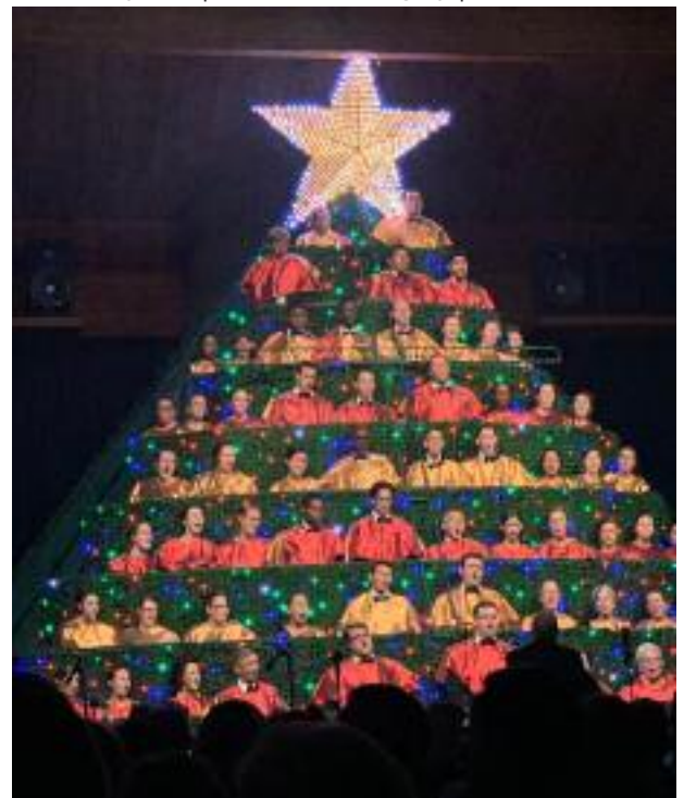
Hobe Sound Bible College/Academy Singing Christmas Tree